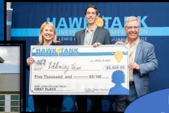
Hawk Tank Business Plan Competition