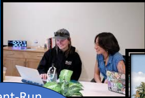
Student-Run Marketing Agency