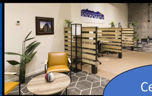
Center for Innovation

630 undergraduate students 23 full-time faculty 7 majors, 9 minors, 4 concentrations, 5 certificates